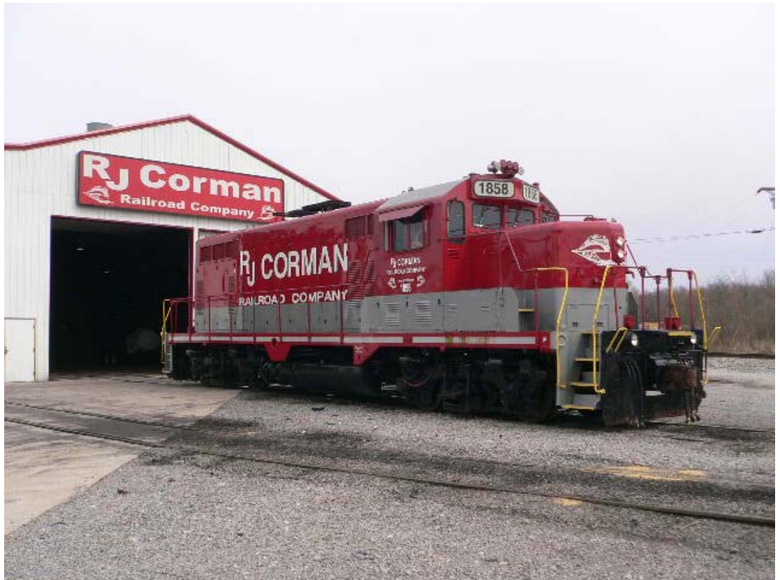
Right and Below: Geeps at Guthrie, KY, March 7, 2011.